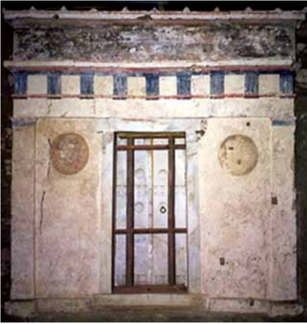
Fig. 4 The façade of Tomb III of the Great Tumulus at Vergina, (after Andronicos 1984, 199).

developmental phase and uncertainty on the part of the builders about the stability of the tomb. 28