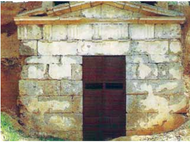
Fig. 7 The façade of the ‘Soteriades Tomb’ at Dion, (after Touratsoglou 2004, 260).

pilasters that also act as doorjambs and a lintel that also serves as an entablature with six triglyphs and five metopes as seen at Tomb III at Malathria-Dion. This tomb illustrates a decline in façade embellishment in the late third century, as is noticeable in Vergina, and the introduction of plain façades in the later third century. The reduction and eventual elimination of the columns indicates that the function of pilasters as supporting members is beginning to disappear.