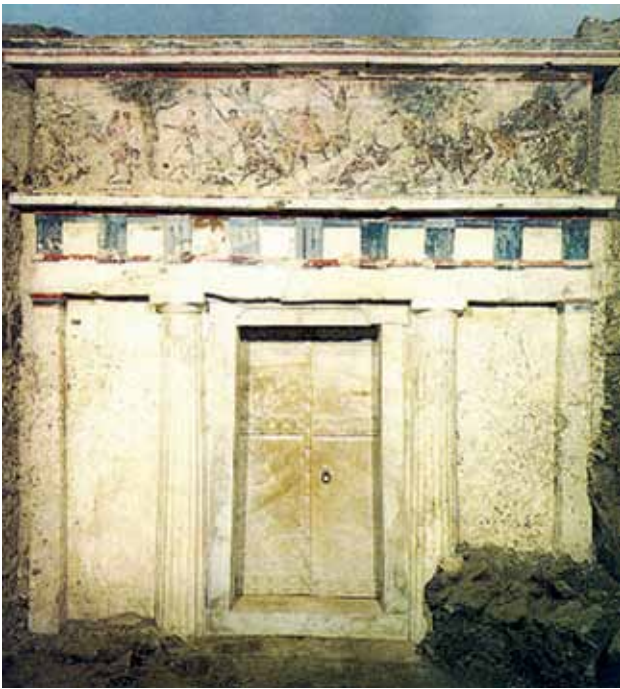
Fig. 3 The façade of Tomb II of the Great Tumulus at Vergina, (after Andronicos 1984, 101).