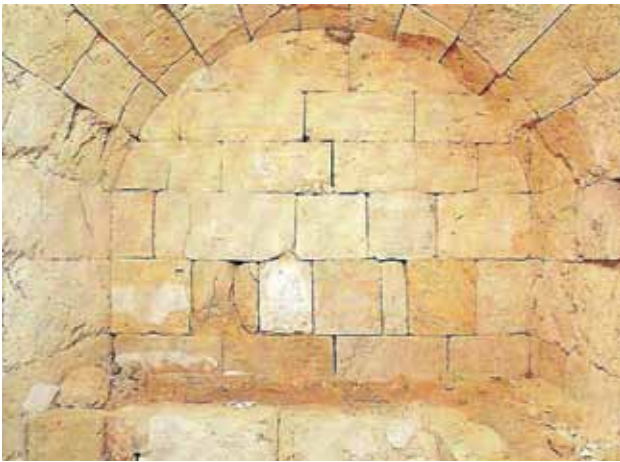
Fig. 2 Barrel-vaulted tomb at Amphipolis, (after Lazaridis 1997, 70).

Aigai as a result of the excavation of a palace and the discovery of a number of 'royal' Macedonian tombs. From the fifth century BCE, the capital was relocated to Pella, and as a result Aigai continued as the Macedonian royal burial grounds and cult centre. At Vergina, tombs of distinct 'Macedonian' type were discovered in the Great Tumulus and have been labelled royal (as opposed to simply aristocratic) by the excavator. 5 To date, a total of eleven tombs have been uncovered in the Vergina area. Elsewhere, Macedonian tombs are principally located in the Bottaia district which is enclosed by the Axios and Haliakmon Rivers and bounded by the mountain ranges of Bermion and Paikon.