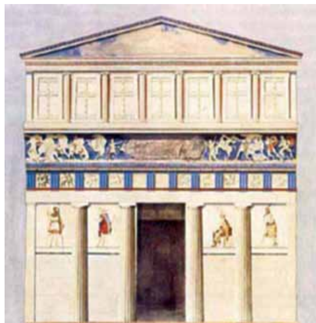
Fig. 8 The façade of the 'Tomb of the Judgement' at Lefkadia, (after Touratsoglou 2004, 202).

The façades of the Macedonian tombs as a whole are generally eclectic, but the royal tombs at Vergina illustrate a feature not observed at any other tomb group. Tomb II and Tomb III of the Great Tumulus at Vergina provide the only examples of the utilisation of a frieze as a terminating member rather than the conventional Doric pediment. The 'Tomb of the Judgement' at Lefkadia also features an exaggerated frieze, but the frieze itself was not utilised as a terminating member but rather the platform for the second