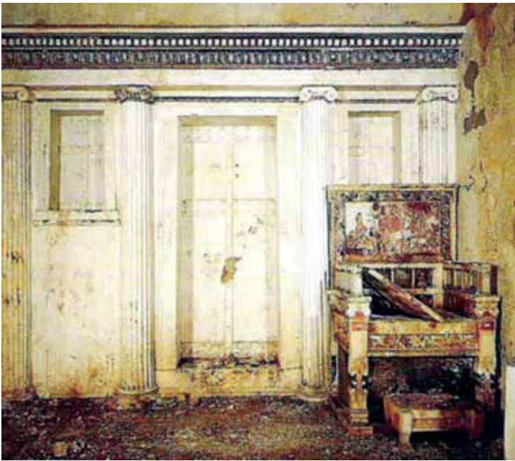
Fig. 5 The rear wall of the burial chamber of the 'Tomb of Eurydice' at Vergina, (after Drougou & Saatsoglou-Paliadeli 2004, 60).

example of what becomes a characteristic of third century Macedonian tomb façades; a decrease and reduction in architectural ornamentation.